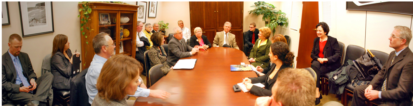
Senate Agriculture Committee Chairman Debbie Stabenow (D-MI) meets with Michigan apple leaders.